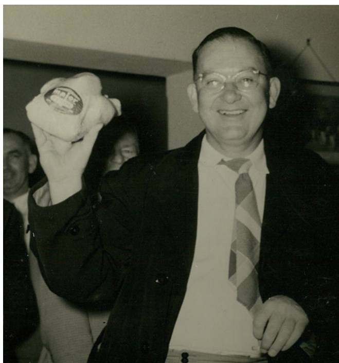
Winner Winner Chicken Dinner!