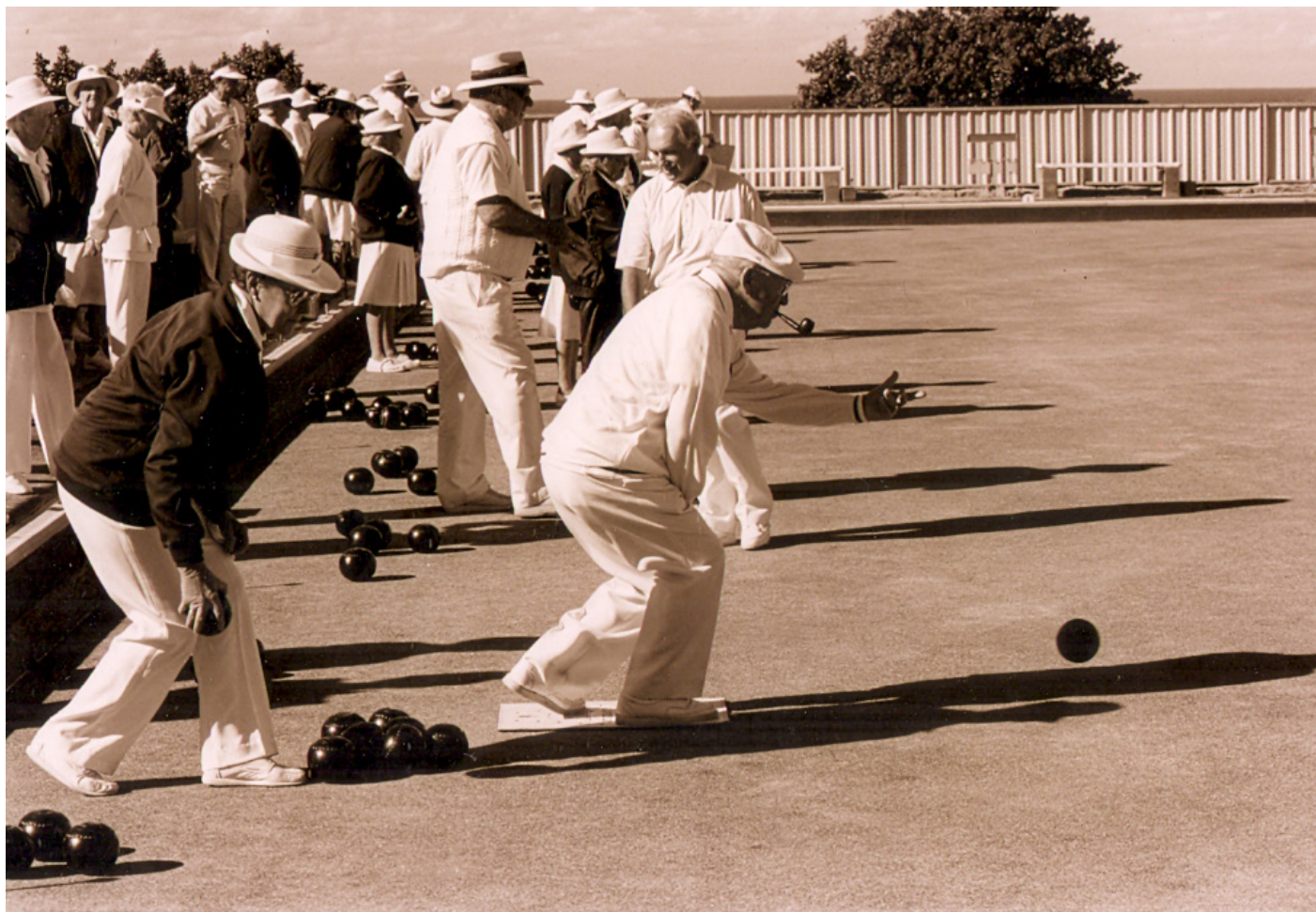
On the shoulders of giants